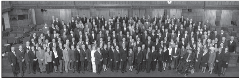
National Caucus Photo 2011