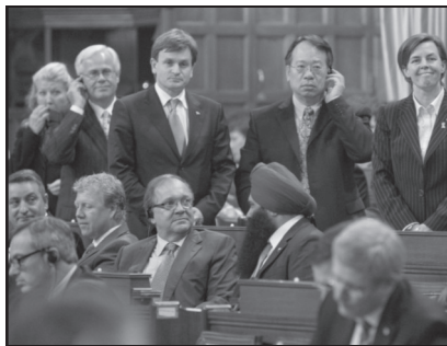
Chungsen Leung during a vote in the House of Commons last Fall.